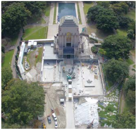
One year on from the start of the Anzac Memorial Centenary Project.