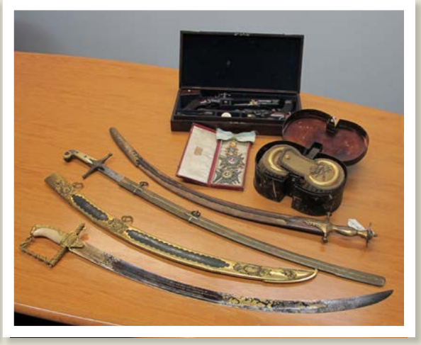
Sir Maurice Charles O'Connell (image from National Library of Australia) and the O'Connell Collection.