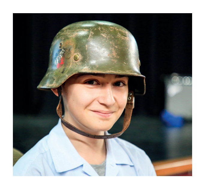
Cover: Jack Harris, photo courtesy Anzac Memorial; Left: Photo courtesy Kerrin Lovell; Right: Photo courtesy Anzac Memorial